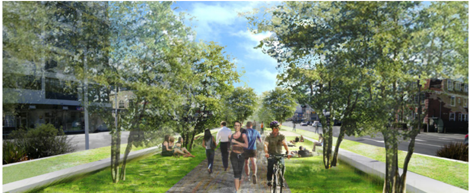
TOWARDS WELLINGTON 2040