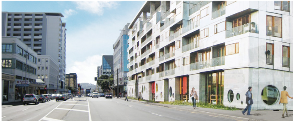
TOWARDS WELLINGTON 2040