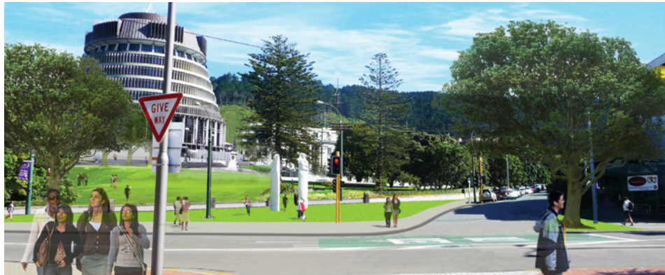
TOWARDS WELLINGTON 2040