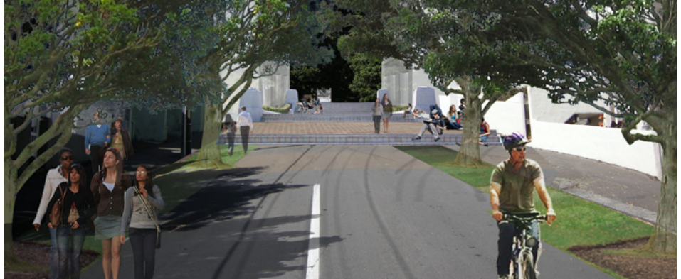
TOWARDS WELLINGTON 2040