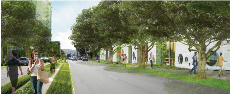
TOWARDS WELLINGTON 2040