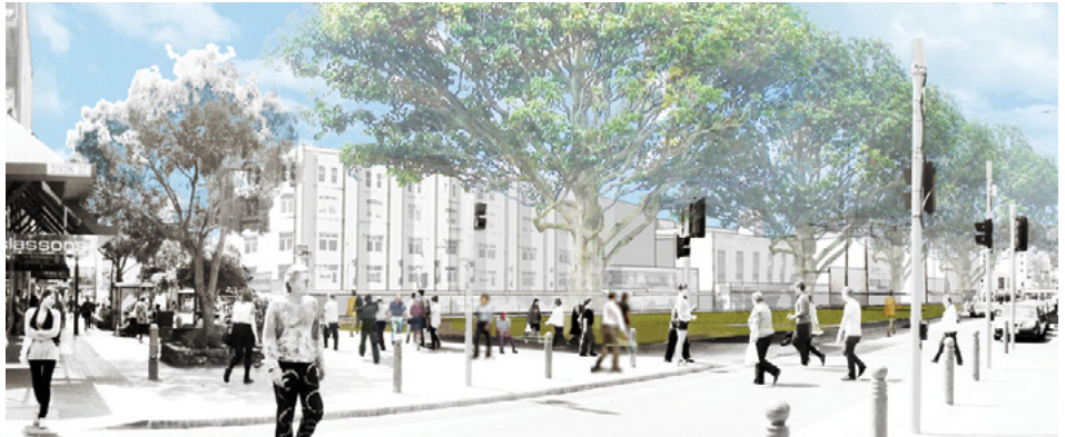
TOWARDS WELLINGTON 2040