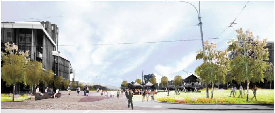
TOWARDS WELLINGTON 2040